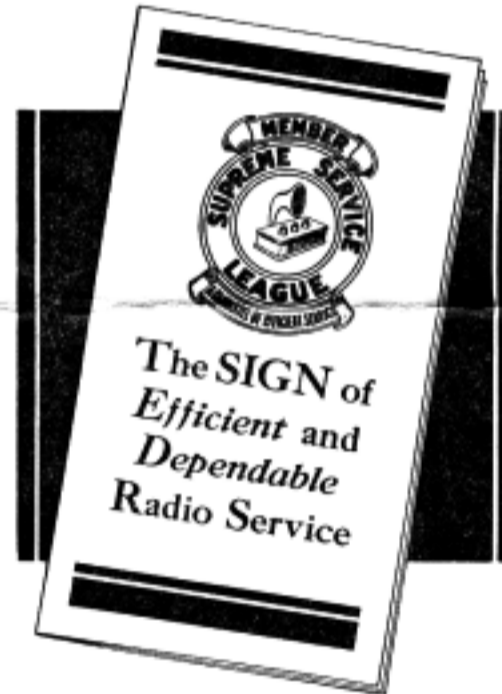
Cut No. S-14—Price, 30c each. Post prepaid.