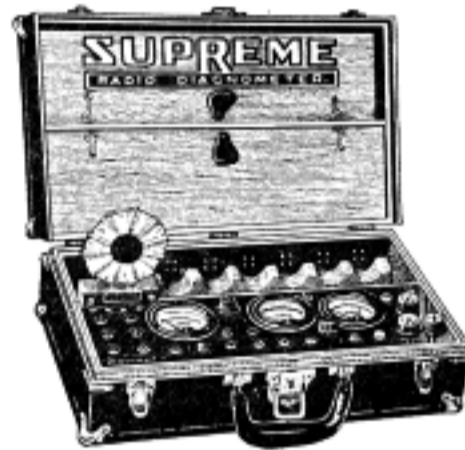
Cut No. S-13—Price, 30c each. Post prepaid.